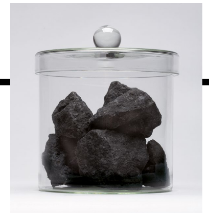
Lead slag, North Rhine-Westphalia, Ruhr Area, Essen-Frintrop

History The department of industrial and contemporary history, especially of the Ruhr region, is particularly worth seeing and is located on the lower level "History". This department divides the object worlds less according to their materiality and more according to aspects of content. In addition to areas such as everyday life, leisure, household, the world of goods and crafts, the legacies of mining, iron and steel can be visited here, as well as the phenomena of religion, war, representation and childhood. Throughout the entire tour, the open architecture creates not only close-up perspectives on the objects, but also inspiring and curiosity-awakening distant perspectives on the collection holdings on the other levels. This play with perspectives reveals new insights and surprising connections between the various collections and their history.