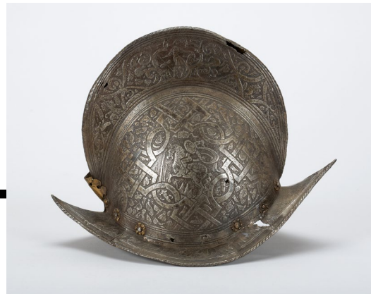
Parade helmet (morion), Northern Italy, around 1580/90