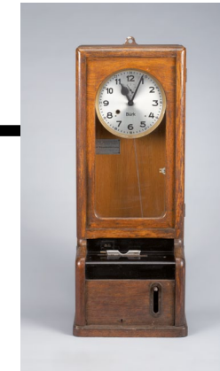
Punch clock, Württembergische Uhrenfabrik Bürk, Schwennigen am Neckar, 1950-1969