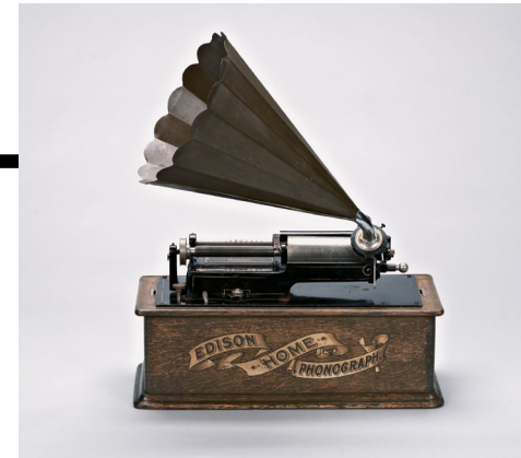
Roller player "Edison Home Phonograph", Cologne, 1904

Nature On the first level, "Nature", the presentation of the natural science collections is divided into the areas of "inanimate nature" with raw materials and rocks, and "animate nature", i.e. fossils ranging from bacterial colonies to plants and vertebrates. In addition to giant crystals, large ammonites, a giant tree and the marine reptile wall, very important individual collections, such as the Wuppertal Fuhlrott collection with the special thunder horse and parts of the Vester plant collection with its dry and wet preparations, will be on public display. One of the highlights is certainly the presentation of the extensive ammonite collection of the museum.