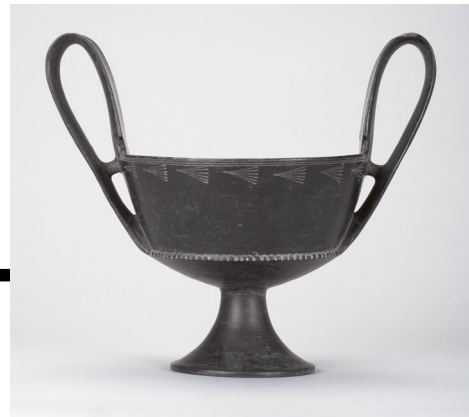
Etruscan bucchero-cantharos, Vulci, 630-575 B.C.

Culture On the middle level, "Culture", with the areas of archaeology, the Middle Ages and pre-modern times, an extensive display and study collection of over a hundred skull replicas impressively illustrates the transition from natural to human-influenced cultural history. The skulls represent more than two million years of human history. In addition, a large number of prehistoric and early historic clay and glass vessels as well as objects made of wood, illustrate the typical material composition of an archaeological and pre-modern collection. They divide the level into the departments of ceramics, glass, stone and furniture, household goods, agriculture and handicrafts – from the ancient advanced civilisations thousands of years ago to the early modern period before industrialisation.