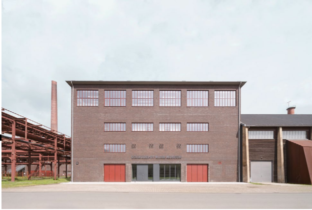
Exterior view of the Ruhr Museum's Schaudepot at the Zollverein coking plant