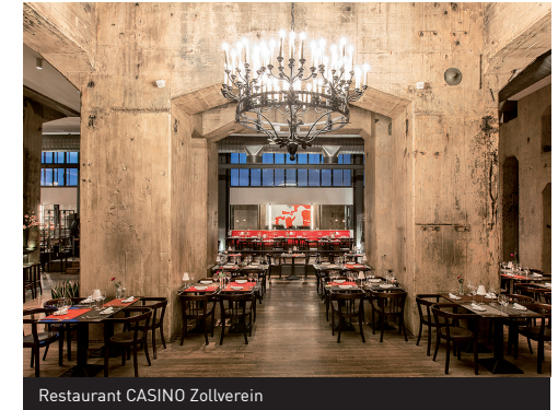
Restaurant CASINO Zollverein

Interactive exhibition with more than 120 experimental stations