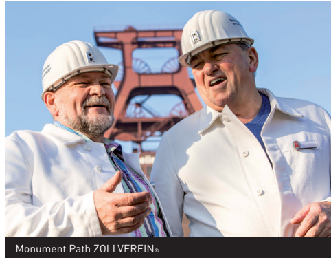
Monument Path ZOLLVEREIN®

Orientation and information at the Zollverein World Heritage Site